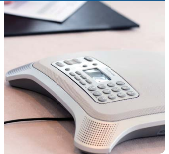
KX-NT700 IP CONFERENCE SYSTEM V2.0 BROCHURE